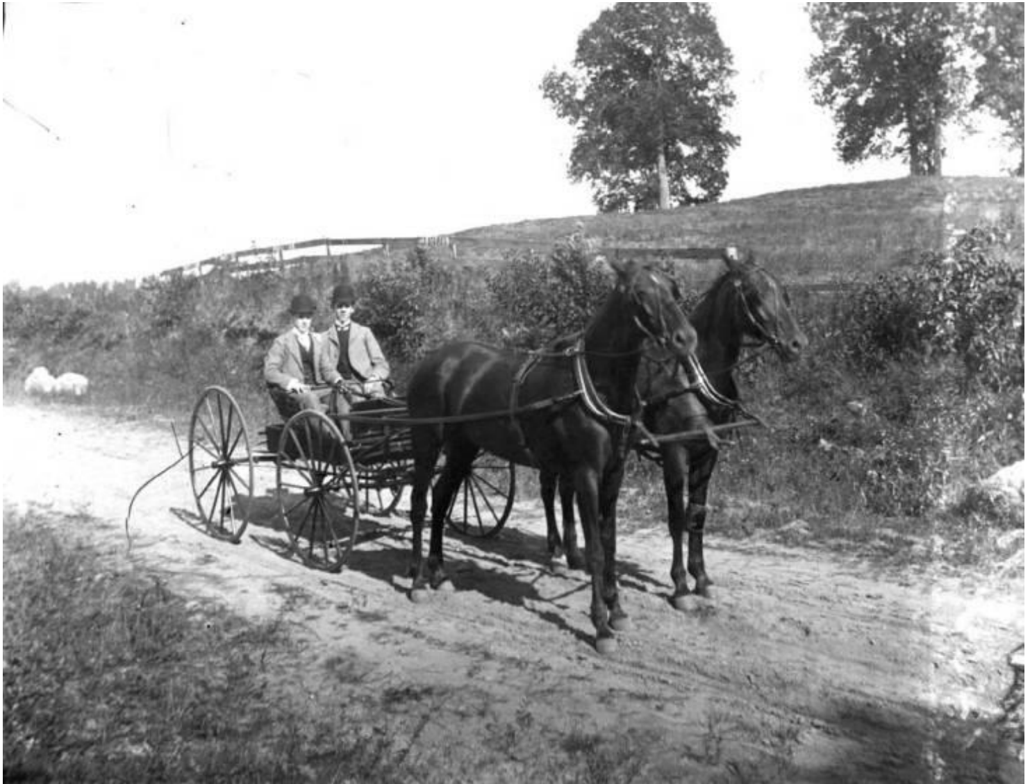
Men in Open Carriage Southport, CT 1890s, 1900?