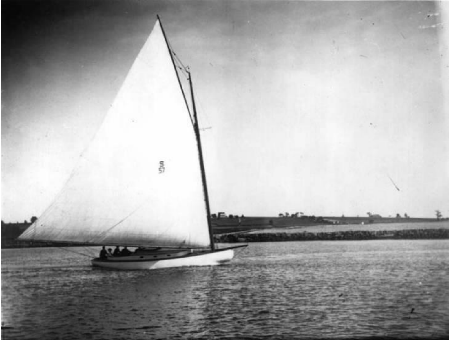
Sailboat, Southport Harbor Southport, CT ca. 1890s