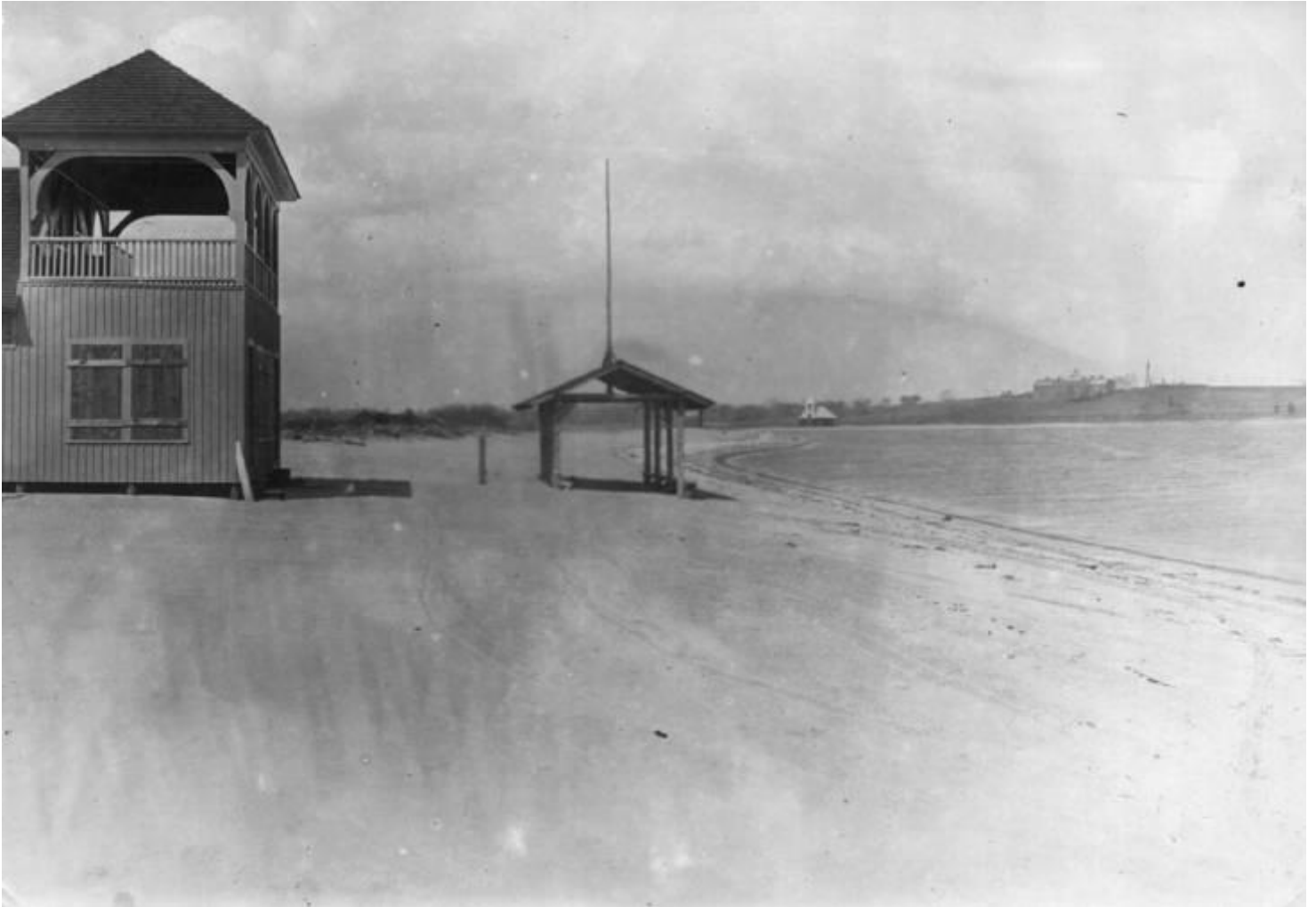
Rescue Station and Church, Black Rock Shore Bridgeport, CT Early 1900s?