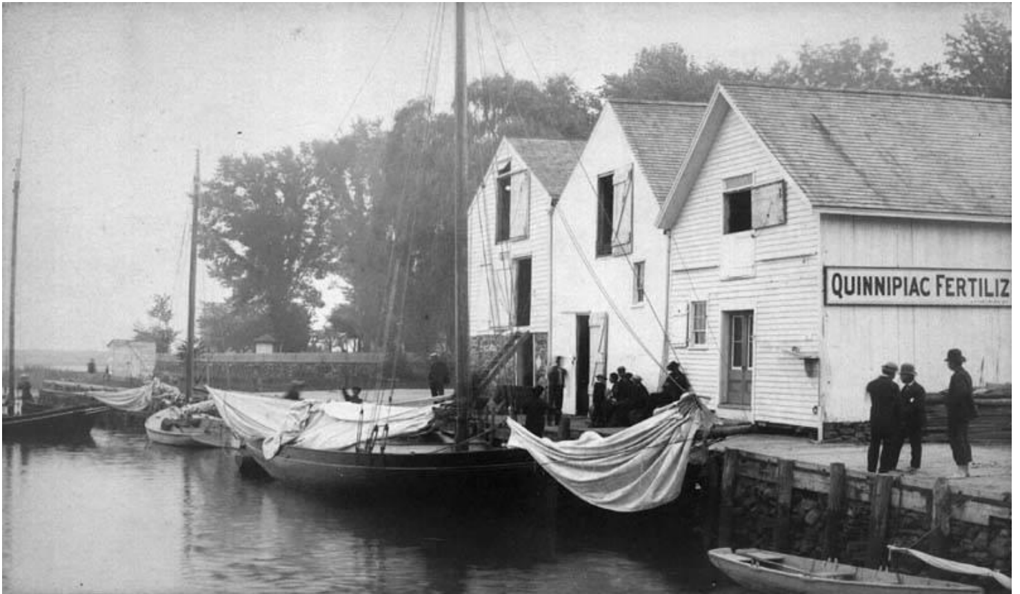
Meeker Warehouses Southport, CT 1887