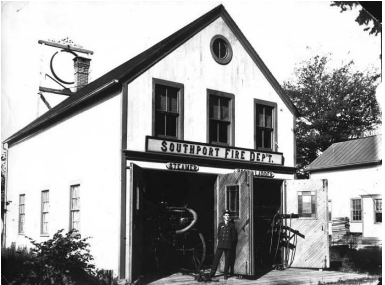
Southport Fire Department Southport, CT 1899