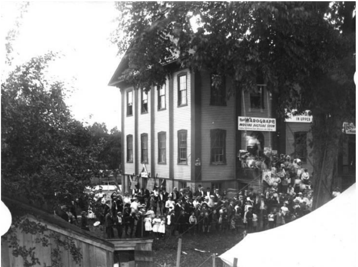
Pequot School Grounds Southport, CT Early 1900s