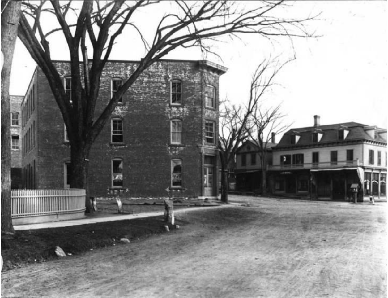
Hall Block and Jennings Building, Main and Harbor Rd Southport, CT 1896?