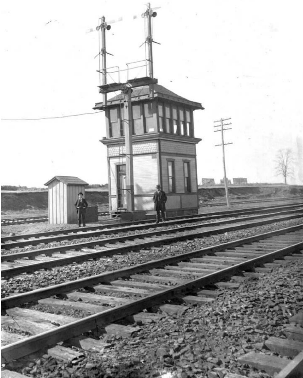
Railroad Block House Southport, CT